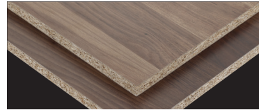
Melamine Faced Particle Board